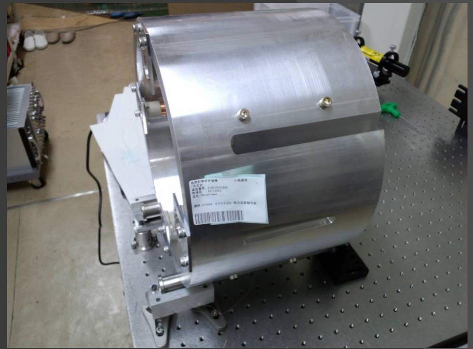
Type-B TM-RM prototype