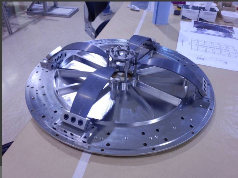
Standard GAS Filter prototype