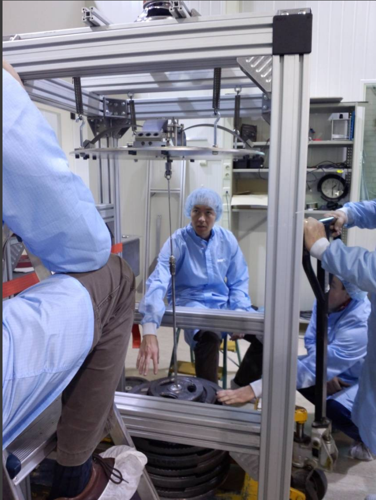
Test of GAS Filter at NIKHEF